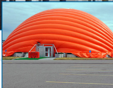
Pop-up retail, Halloween store