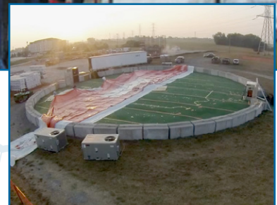
Concrete blocks as anchorage

A climate controlled, rapidly deployable, reusable, environment for Special Events.