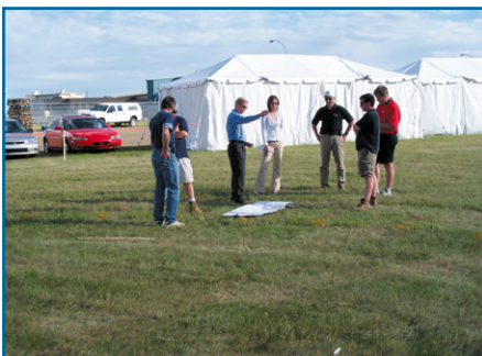
A crew of 6 to 8 average individuals is all that is required for setup.

Installation of an Airwise Temporary Event Venue is a straightforward process, which can usually be completed in a single day or less, by a group of 6 to 8 average individuals with no special skills, and a minimum of heavy equipment.