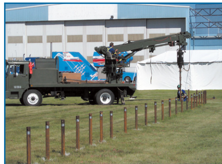
Screw-in piles were installed for anchorage in this case..

Finally, the power is hooked up, or the generator started, the controls and fans are turned on and the cover is rapidly inflated over the site.