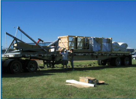
All necessary structure components delivered on 1 flatbed.

Edmonton, Alberta played host to the inaugural version of the Edmonton Indy in 2005. As part of this event, Airwise technology was selected to provide a temporary venue for a static indoor display of racing cars.