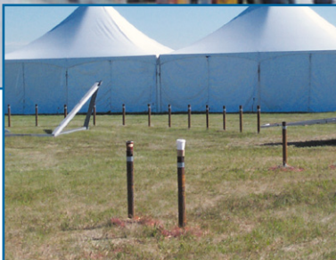
Removable, screw-in anchors