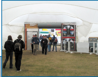
Large doors for easy access