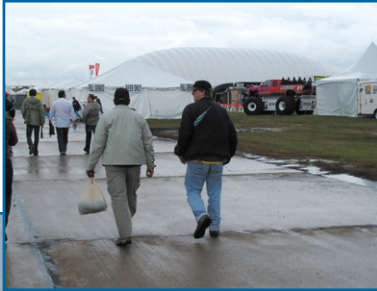
Ignore inclement weather.