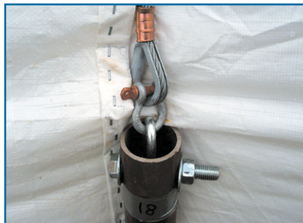
Cables anchor to Screw-in pilings with a simple shackle.

Your climate controlled Airwise Structure will be filled with natural daylight. Visitors are free of wind, rain or snow, regardless of local weather conditions.